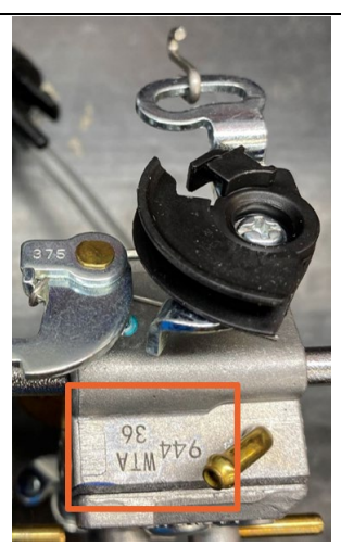
Marked WTA-36 Marked WTA-40

How to define which Carburettor the chainsaw is originally equipped with.